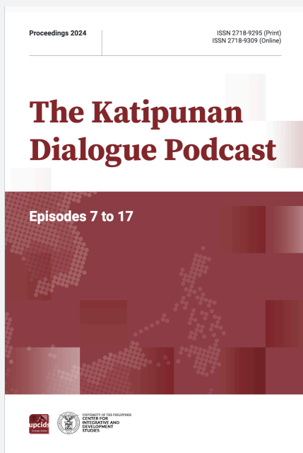
The Katipunan Dialogue Podcast 2022 (Episodes 7 to 17)