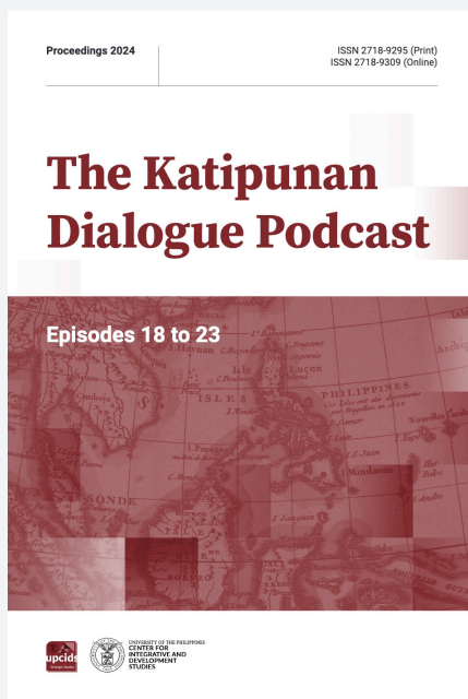
The Katipunan Dialogue Podcast 2023 (Episodes 18 to 23)