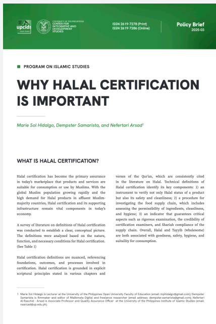
Why Halal Certification is Important