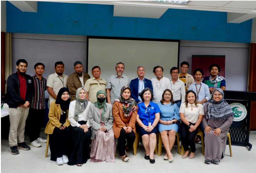
■ Group photo of the organizers and attendees of the Halal Forum, held on June 25, 2024.

Challenges, and Moving Towards a Common Direction”—highlights the urgent need for collaboration among various stakeholders to tackle the challenges facing the halal industry. He further emphasized that by working together, the country could foster a resilient halal ecosystem that drives both economic prosperity and cultural harmony.