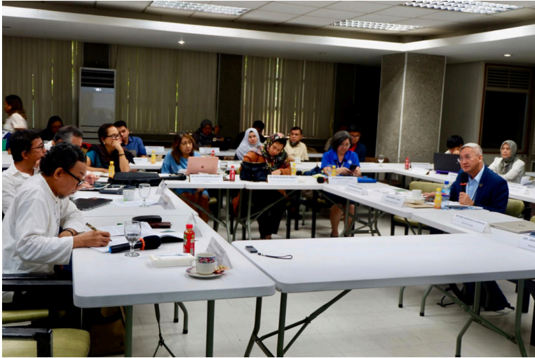
■ Participants engaged in the roundtable discussion at the Halal Forum on June 25, 2024